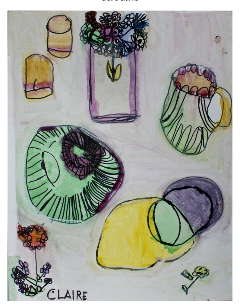
Claire Clarke, Garden View, 2013